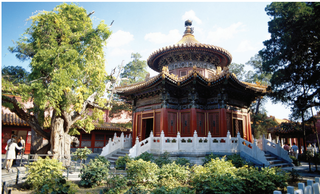
Tour the historic Forbidden City complex on Day 3.

afternoon, we tour Xian's impressive nine-mile city wall and moat. Tonight, we enjoy a special dinner of traditional Chinese dumplings. B,L,D