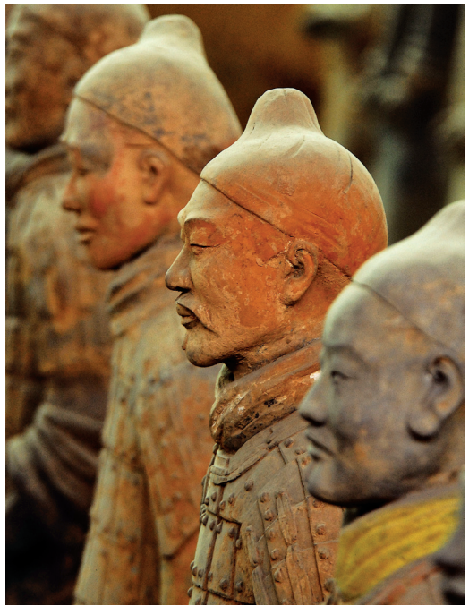
View Xian's Terra Cotta Warriors on Day 7.

Day 14: Depart for U.S. We depart Shanghai for our return flights to the U.S. B