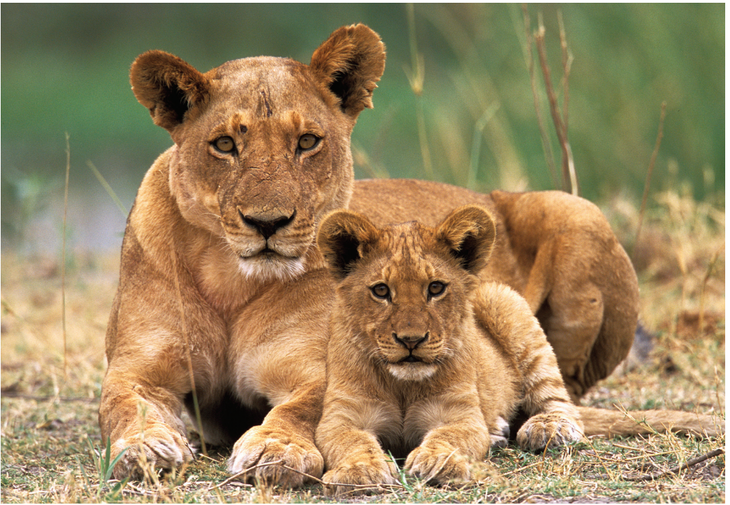
Like mother, like ... Lioness and cub keep watch in the bush.

Day 6: Masai Mara Again today we're "on safari," with morning and afternoon game drives in this preserve that is just slightly larger than the state of Rhode Island. When not out in the bush, we are at leisure to enjoy the amenities of our luxury tented camp, including a swimming pool and spa. B,L,D