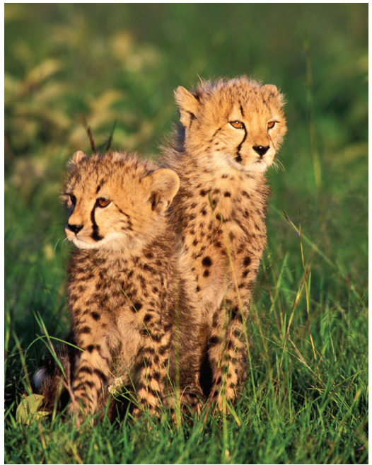
Cheetah cubs with their distinctive markings