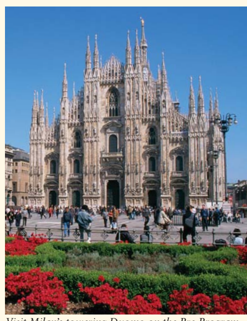
Visit Milan's towering Duomo on the Pre-Program option, home to some of Italy's finest religious art.

Cruise among Lake Maggiore's enticing islands graced with elegant villas and striking natural beauty. Isola Bella, Isola di San Giovanni, Isola Madre and Isola dei Pescatori are collectively known as the Borromean Islands,