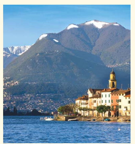
A funicular ride to the top of Switzerland's Monte Brè offers magnificent views of the resort towns of Lake Lugano.

shops leading to the Piazza Cavour and the tranquil lakeside promenade. The Cattedrale di Como, considered to be the most beautiful cathedral in Lombardy, took nearly 400 years to complete and reflects a seamless blend of Gothic and Renaissance styles.