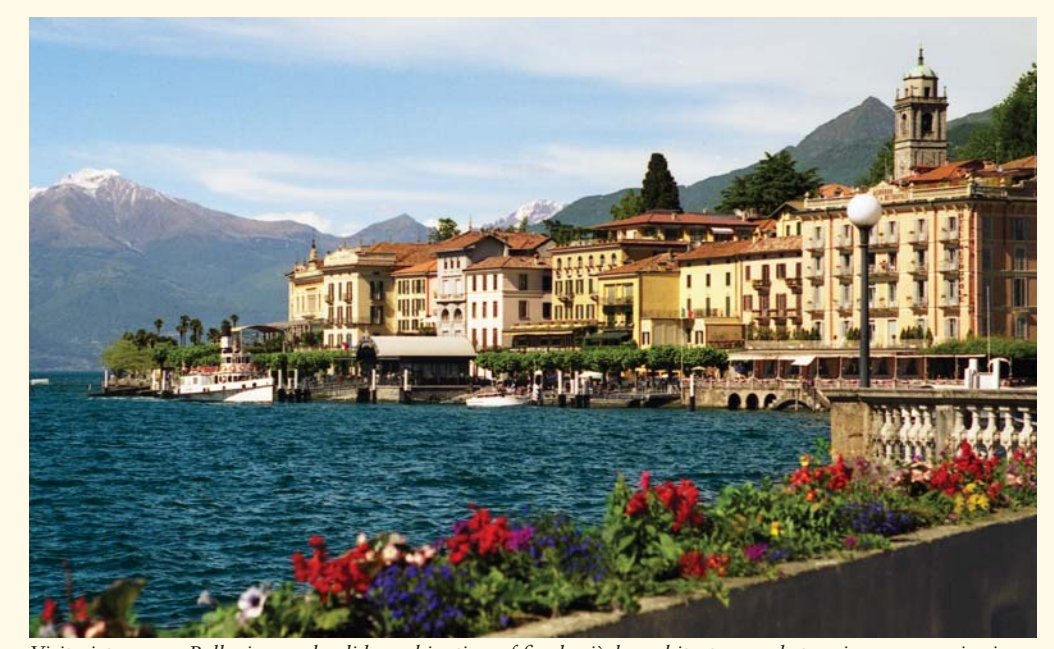
Visit picturesque Bellagio, a splendid combination of fin-de-siècle architecture and stunning panoramic views of Lake Como and the majestic Alps. Inset above: Statue at Villa del Balbianello.