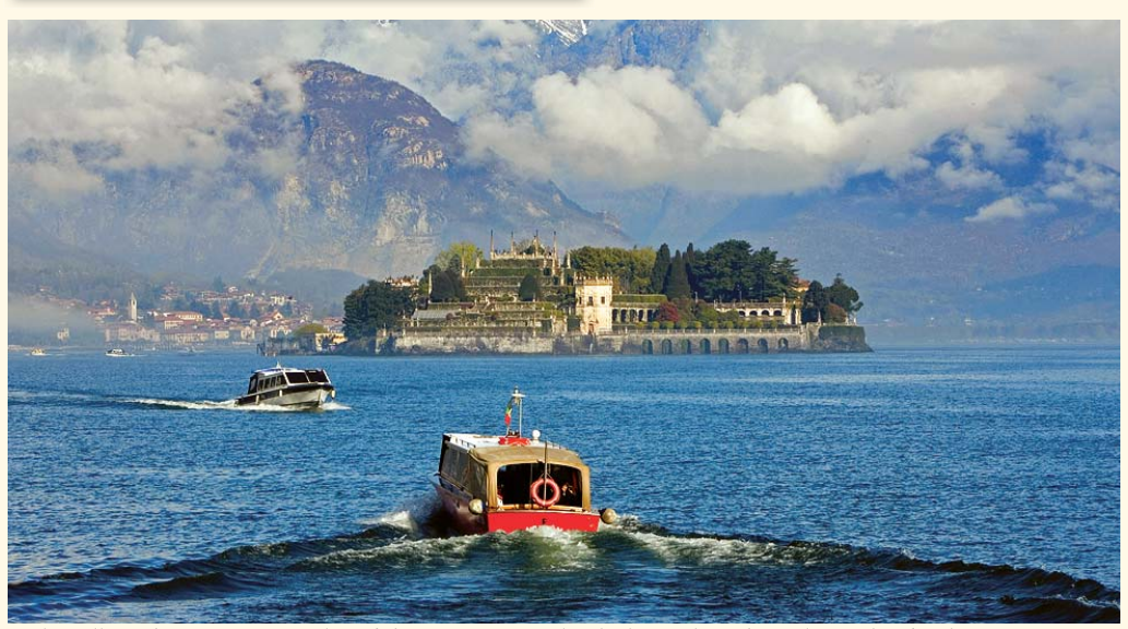
Isola Bella is the most spectacular of the Borromean Islands, located on the Italian side of Lake Maggiore. Visit the magnificent 16<sup>th</sup>-century villa and stroll through one of the most beautiful gardens in the world.

Founded by the Romans in 196 B.C., Como's cobblestoned passages wind past medieval towers and walls, Renaissance palaces and churches, Neoclassical 19th-century villas and small family-owned