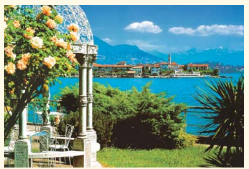
Picturesque lakes, Alpine views and grand villas define the beauty and charm of Lake Maggiore.