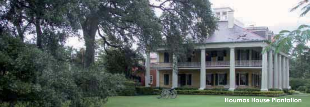
Houmas House Plantation