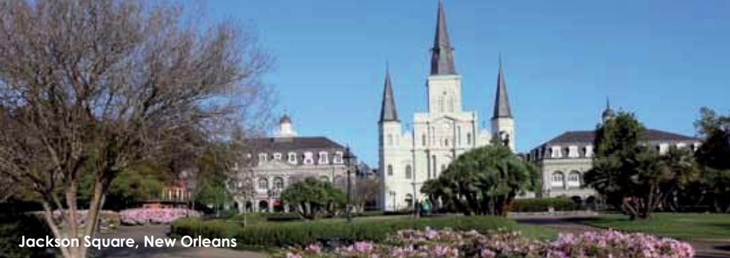
Jackson Square, New Orleans