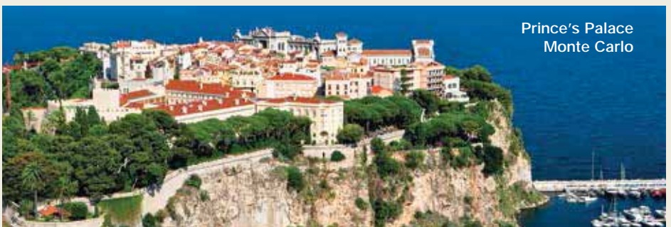
Prince's Palace Monte Carlo

For reservations and information, please call the UNC General Alumni Association toll-free at 877.962.3980 or call Go Next for additional information: 952.918.8950 or 800.842.9023