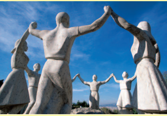
Left: Sardana Dance Monument, Montjuïc Park, Barcelona | Below: People in traditional white and red clothing, Pamplona