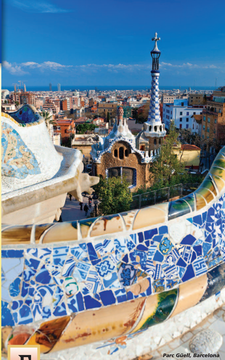
Parc Güell, Barcelona

F rom the elegant Spanish capital of Madrid to modernist Barcelona, travel from the heart of Spain to the country's northern reaches. Admire scenic vistas of seascapes and vineyards as well as breathtaking cityscapes filled with castles and cathedrals. Along the way, delve into the diverse cultures of the Castilian region, Basque Country and Cataluña on a journey through Spain's most diverse communities. Here, food, language, clothing and more define very different cultures and create a rich tapestry. The people of these regions, despite their differences, possess at least one common Spanish trait: an irresistible passion for life!