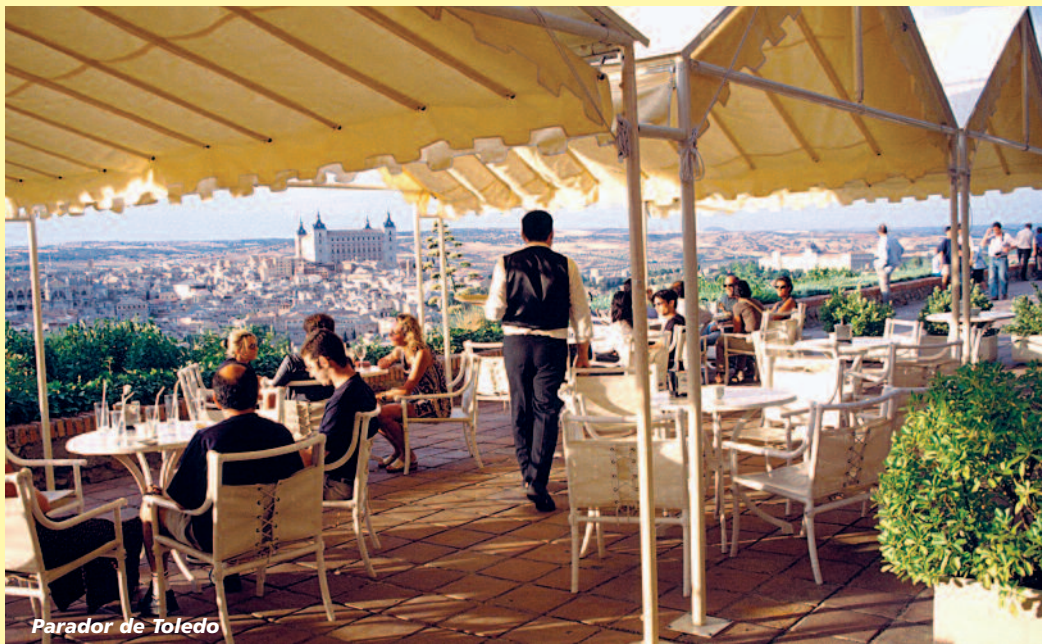
Parador de Toledo