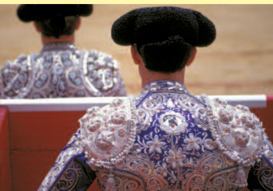
Above: Matadors, Pamplona