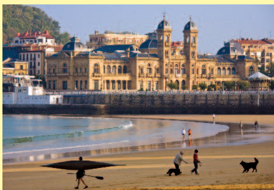
Top left: Burgos Cathedral | Top right: Gran Vía, Madrid | Above: San Sebastián | Left: Detail from "The Burial of the Count of Orgaz," Toledo

Local Flavor: Tonight, enjoy a classic Rioja dinner featuring the famous wine of the region.