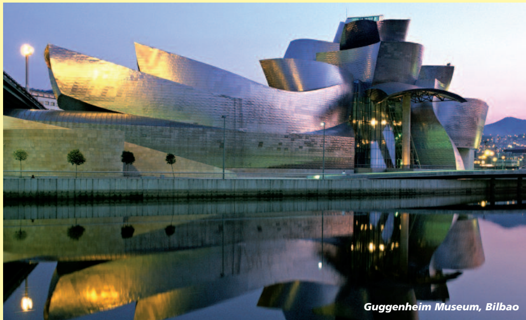
Guggenheim Museum, Bilbao