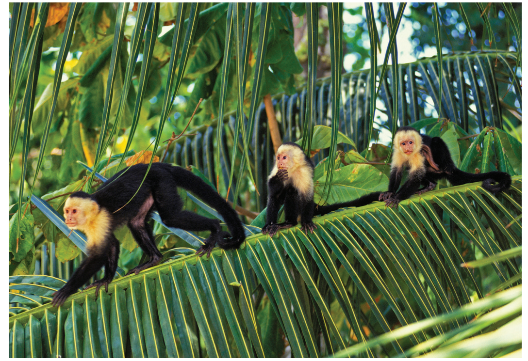
Capuchin monkeys abound in Costa Rica's rain forests.

before and after dinner (at a local restaurant) from a comfortable perch at our hotel. B , L , D