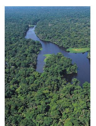
Tortuguero canals (optional extension)

Day 9: Guanacaste A float safari on the Tempisque River highlights this morning's excursion to the Palo Verde region, which is both an extraordinary wetland and also one of the world's last tropical dry forests. On this boat ride, we should see abundant bird- and wildlife, including monkeys, iguanas, sloths, and crocodiles, in this unique ecosystem. We enjoy lunch at a local restaurant then return to our hotel mid-afternoon. The remainder of the day is at leisure along one of Costa Rica's most pristine dark sand