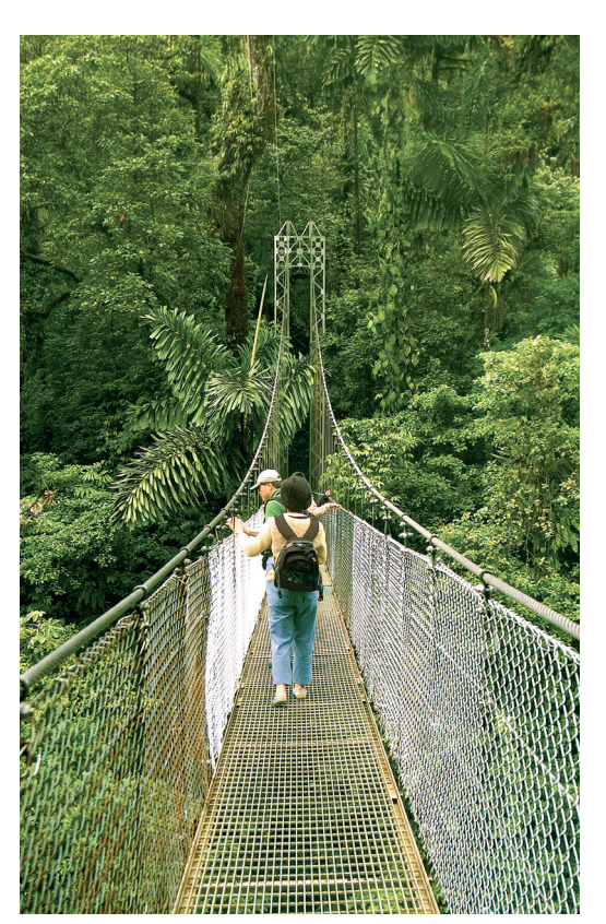
Enjoy treetop rain forest views from Monteverde's Sky Walk.