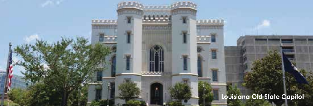
Louisiana Old State Capitol