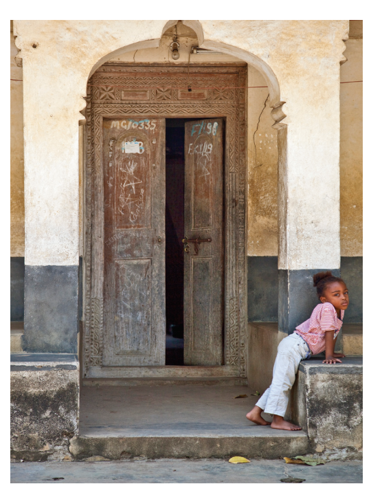
Stone Town, Zanzibar, street scene

A heady mix of Moorish, Middle Eastern, Indian, and African influences (though predominantly Muslim today), Stone Town boasts a labyrinth of narrow alleys lined with shops, homes, hidden courtyards, and extravagantly carved wooden doors, as we see on our afternoon tour. Highlights include the open air market, teeming with exotic fruits and vegetables; the 19<sup>th</sup>-century Cathedral on the site of a former slave market; the Old Fort, offering lovely views of town and the ocean; and "Tippu Tip House," residence of a notorious slave trader. Dinner tonight is on our own. B,L