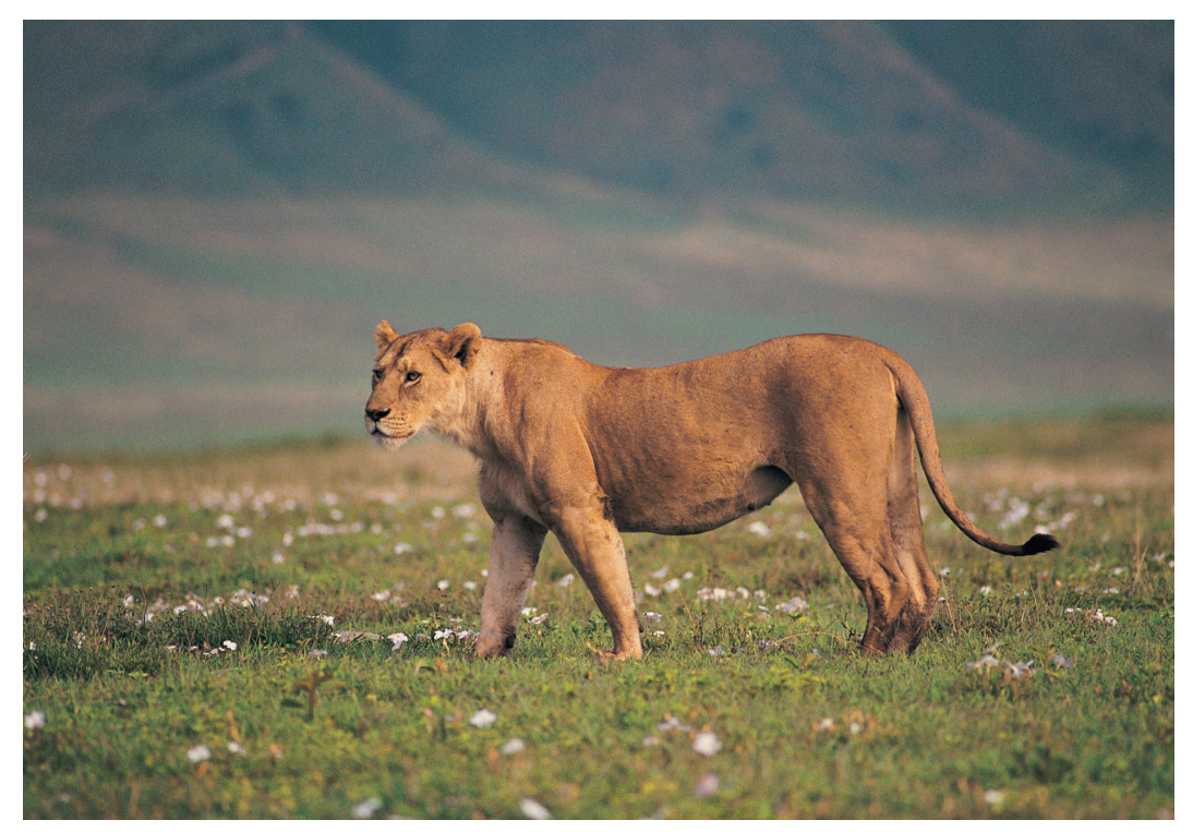
We have multiple opportunities to see big game up close while on safari.

part of the Serengeti region), Olduvai is considered the "cradle of humanity" and ranks as one of the world's most important prehistoric sites. Then we continue on to Serengeti National Park, home to such plains dwellers as the lion, cheetah, zebra, and wildebeest. The Serengeti, the Maasai's "endless plain," is considered Africa's finest park, and we begin to see why on this afternoon's game drive. B,L,D