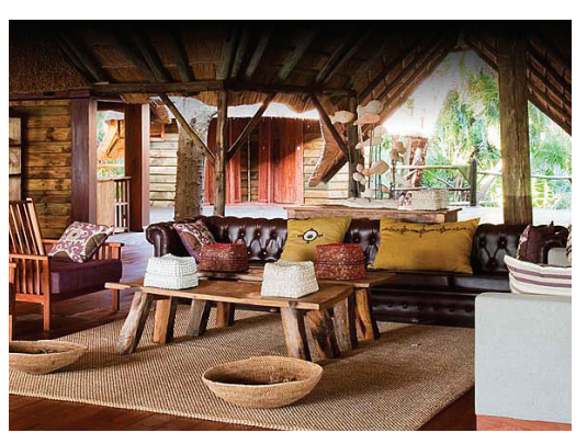
Sanctuary Saadani River Lodge, our luxury retreat Days 11-13