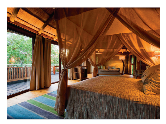
Nature surrounds the lodge's eco-friendly cabins.