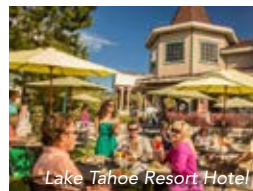
Lake Tahoe Resort Hotel