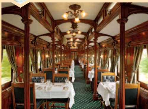
Upper: Rovos Rail suite | Lower: Dining car

Day One Your train leaves Cape Town for Pretoria. Leave behind the mountains and the verdant vineyards of the Western Cape as you make your way to the Karoo, the semidesert plateau that encompasses much of South Africa's interior. Early this evening, arrive at Matjiesfontein, a spa town founded in 1890 by Englishman James D. Logan, who re-created a bit of Victorian London in rural South Africa.