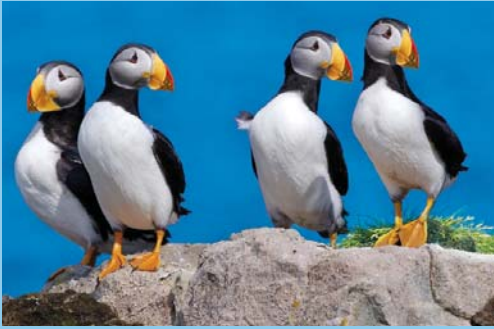
Puffins, noted for their distinctively colorful bills, nest throughout the Aleutian Islands.

Charming, colorful Homer sits amid lofty snowcapped mountains and blue glaciers on beautiful Kachemak Bay, a sheltered arm of lower Cook Inlet. Archaeologists have identified that inhabitants have cooked mussels and clams on these beaches for thousands of years, beginning with the indigenous Inuit and Tanaina. In the 1800s, homesteaders and coal miners comprised the area's population, but today, Homer is known as the "halibut fishing capital of the world," and is home to an eclectic mix of artists, fisherman and outdoor enthusiasts drawn by a wilderness setting adjacent to the clear-water bay and the slower pace of life.