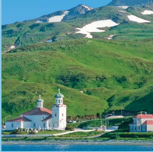
The Orthodox Church of the Holy Ascension evokes the Russian heritage of Dutch Harbor, Alaska.

practiced their subsistence lifestyle here as far back as the fourth millennium B.C. Russian fur trappers came to Kodiak in pursuit of sea otter pelts in the 18 th century. Following the United States' purchase of Alaska a century later, Kodiak's economy shifted to whaling and salmon fishing, and today, its salmon- and cod-rich waters make it one of the busiest fishing ports in the country.