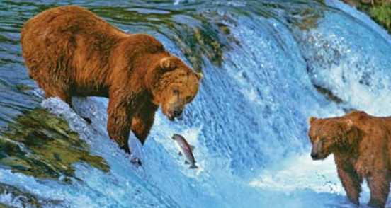
Look for powerful brown bears fishing for salmon in the roaring rivers of the Kamchatka wilderness.

PRSR STD U.S. Postage PAID Gohagan & Company