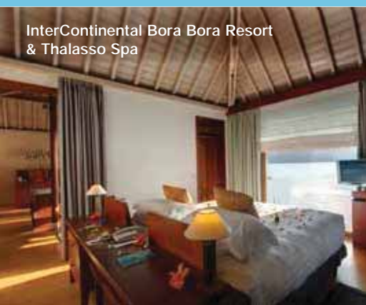
InterContinental Bora Bora Resort & Thalasso Spa

Global Destinations Management, Ltd. and Go Next, Inc. are not responsible for injuries or losses resulting from any causes beyond their own respective and exclusive control. Global Destinations Management, Ltd. and Go Next, Inc. are not responsible for the negligence of the other or any other suppliers or providers. Land accommodations, local transportation, and sightseeing are arranged and operated by Tahiti Nui Travel, which may use other suppliers or providers to render the services. RESORTS AND SIGHTSEEING ARE SUBJECT TO CHANGE.