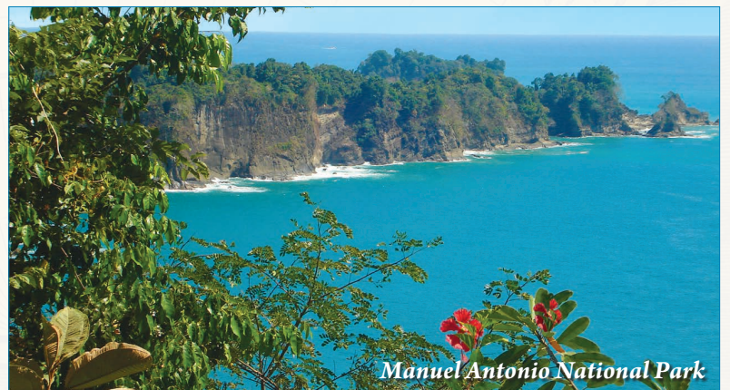
Manuel Antonio National Park