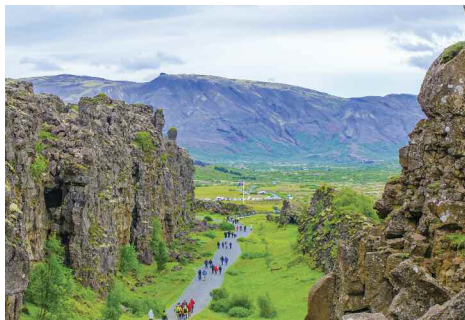
Þingvellir National Park