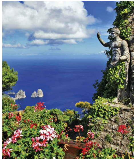
Isle of Capri