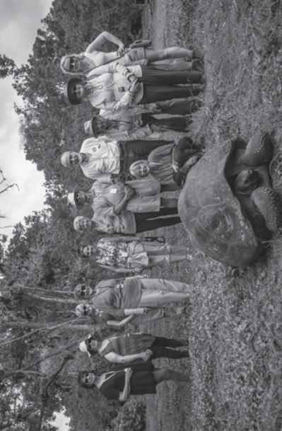
UNC alumni on Orbridge's The Galapagos Islands 2019 travel program.