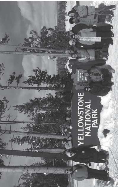
UNC Tar Heels on Orbridge's The Wolves & Wildlife of Yellowstone 2019 travel program.

Special Alumni Rate: Save more than $1,000 per couple