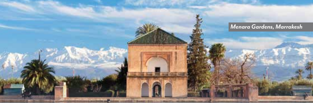
Menara Gardens, Marrakesh