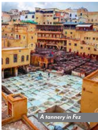
A tannery in Fez

Enjoy an afternoon at leisure to experience the captivating