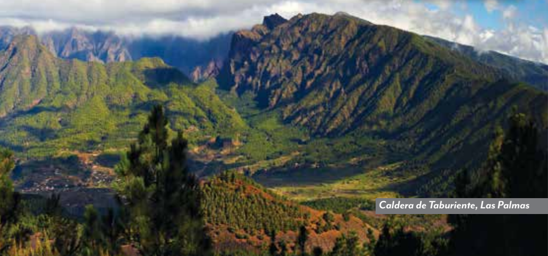
Caldera de Taburiente, Las Palmas