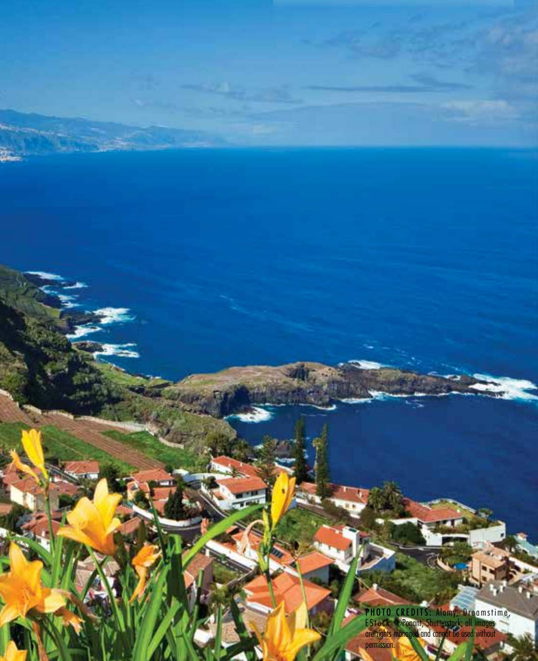
PHOTO CREDITS: Alamy, Dreamstime, ESTOCK, ©Panamint, Shutterstock; all images are rights managed and cannot be used without permission.