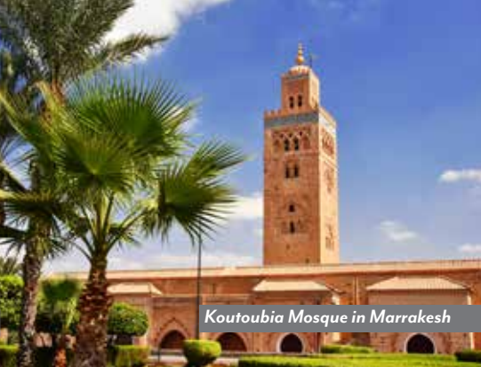
Koutoubia Mosque in Marrakesh