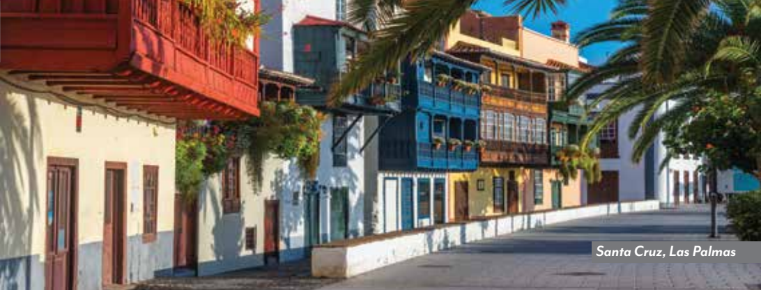
Santa Cruz, Las Palmas