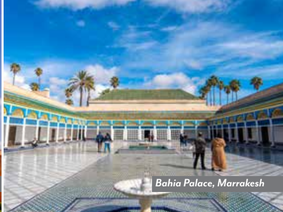
Bahia Palace, Marrakesh

sights and sounds evocative of Humphrey Bogart and Ingrid Bergman's Casablanca . Attend the Captain's Farewell Reception on board this evening.