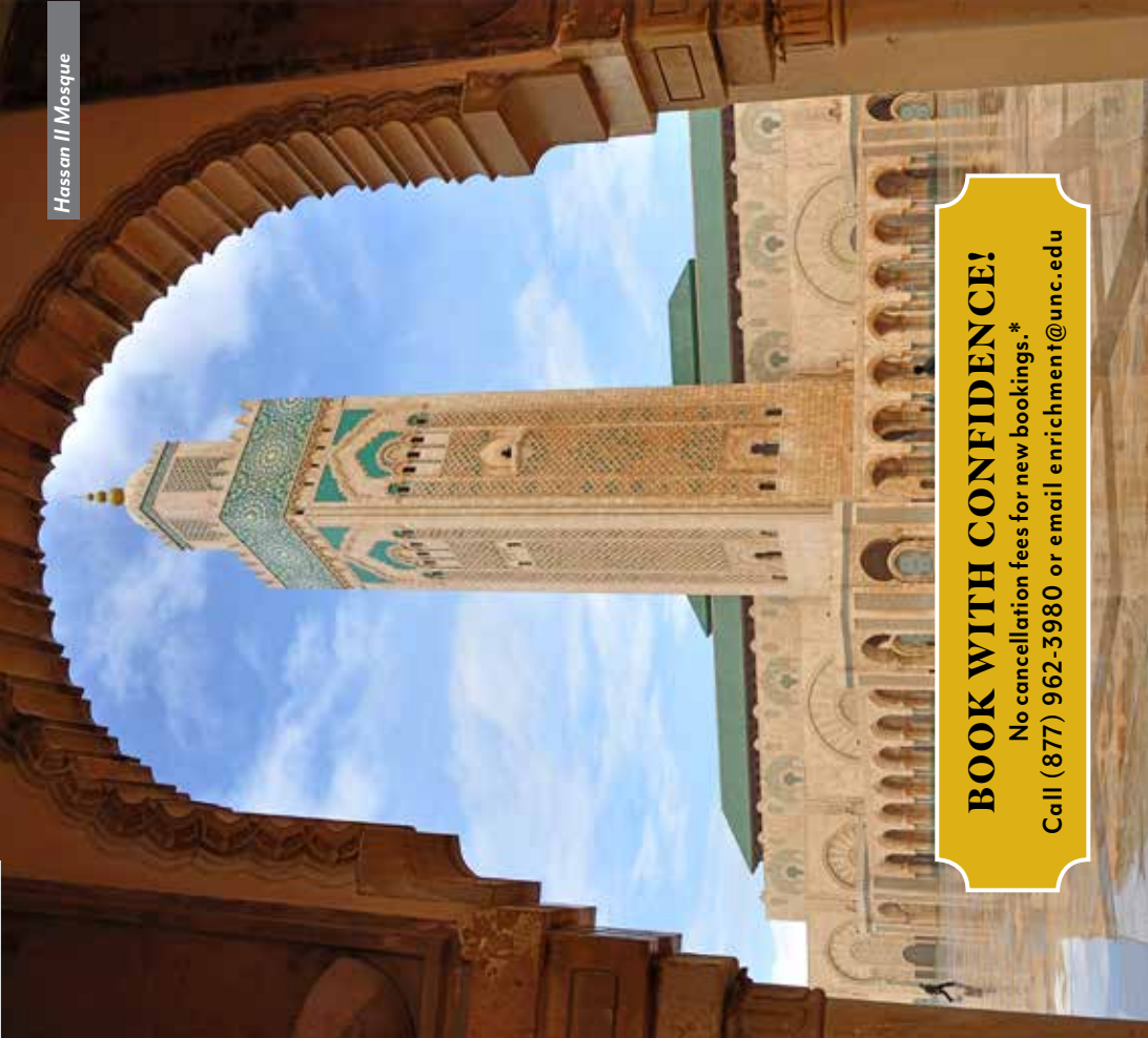
Hassan II Mosque