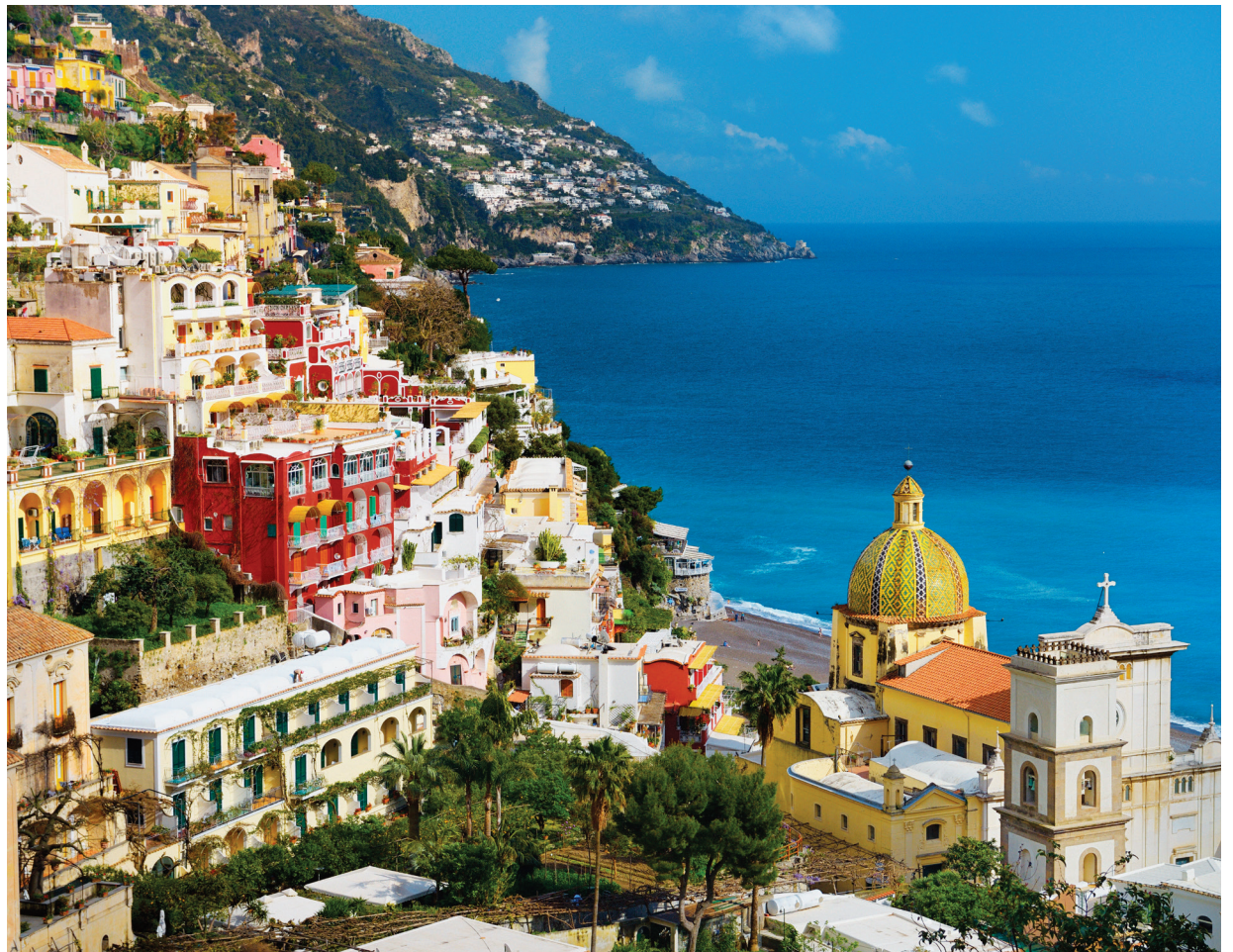
We spend three nights on the stunning Amalfi Coast, with its sheer cliffs, turquoise seas, and classic Mediterranean landscape.

From the breathtaking Amalfi Coast to eternal Rome, through the gentle Umbrian and Tuscan countryside to timeless Venice, this wide-ranging tour showcases ancient sites, contemporary life, priceless art, and beautiful natural scenery. You'll especially appreciate the small size of your group as you stay in unique accommodations in the Tuscan countryside and in a medieval village.