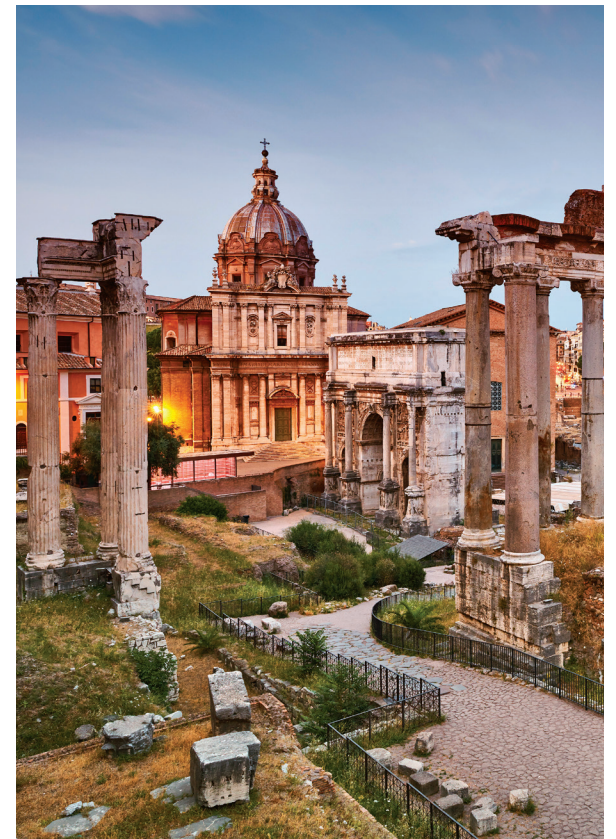
The Roman Forum dates to the 7 th century BCE.

Day 16: Depart for U.S. We depart early this morning for our connecting flights to the U.S. B