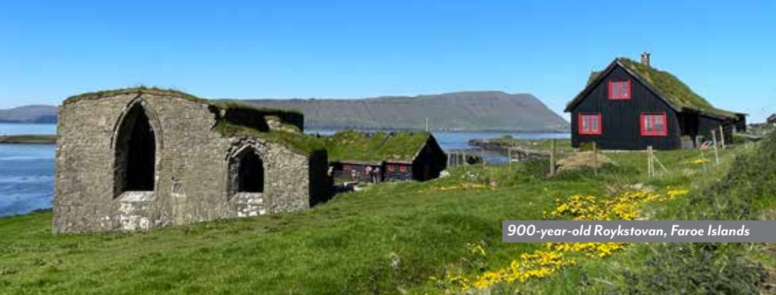
900-year-old Roystovan, Faroe Islands

the legendary Jökulsárlón ice lagoon in UNESCO World Heritage-designated Vatnajökull National Park.