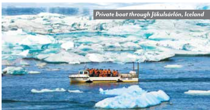
Private boat through Jökulsárlón, Iceland

On a drive from Djúpivogur, enjoy the beauty of the snow-capped mountains that rise amidst the grassy plains. Continue to