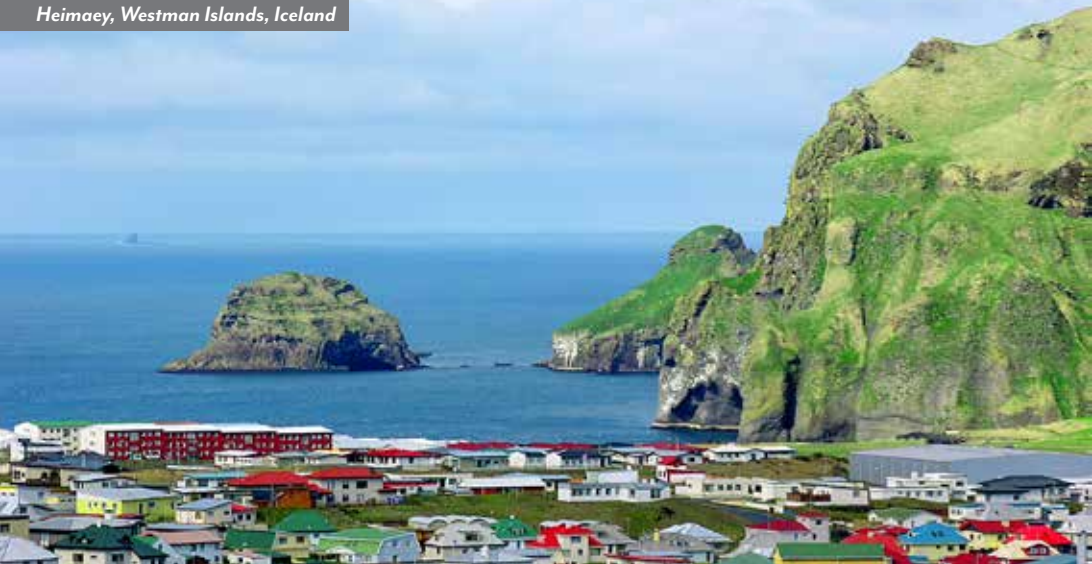
Heimaey, Westman Islands, Iceland

Following breakfast, disembark and continue on the Reykjavík Post-Program Option or transfer to the airport for your return flight home.