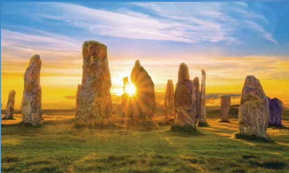
Visit the 5,000-year-old Neolithic ruins of the Standing Stones of Callanish on the Isle of Lewis