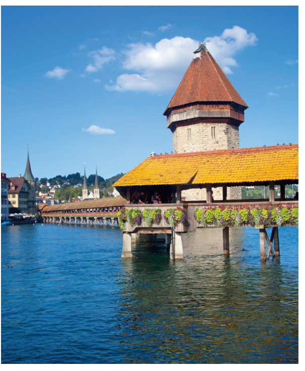
Lucerne's beloved Kapellbrücke (Chapel Bridge)