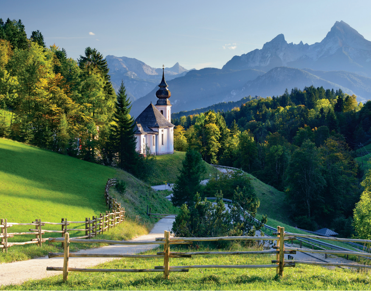
Majestic Alpine scenery surrounds us throughout our tour.

Ratings are based on the Hotel & Travel Index, the travel industry standard reference.