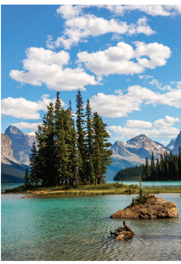
Stunning Maligne Lake and Spirit Island, Jasper National Park