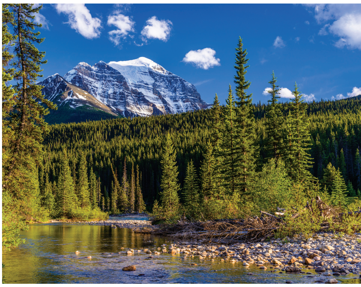
We spend several days amidst the natural beauty of Banff National Park's rivers, mountains, meadows, and forests.

Ratings are based on the Hotel & Travel Index, the travel industry standard reference. Unrated hotels may be too small, too new, or too remote to be listed.