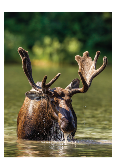
A bull moose enjoys a dip.

Day 7: Lake Louise/Jasper This morning we visit the viewing area to see the lake in the early morning light. Then we depart via the Columbia Icefields Park-