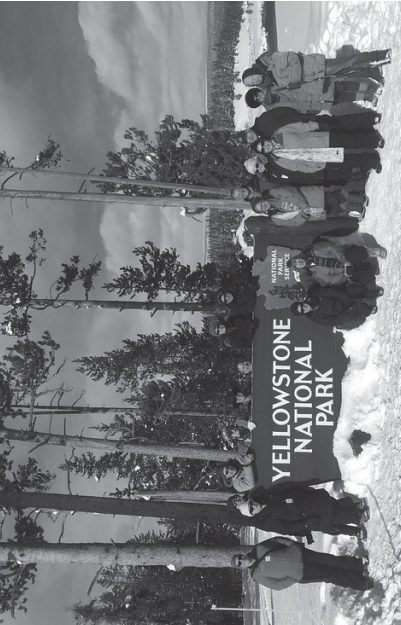
Tar Heels on Orbridge's The Wolves and Wildlife of Yellowstone 2019 travel program.

Special Alumni Rate: Save more than $1,000 per couple