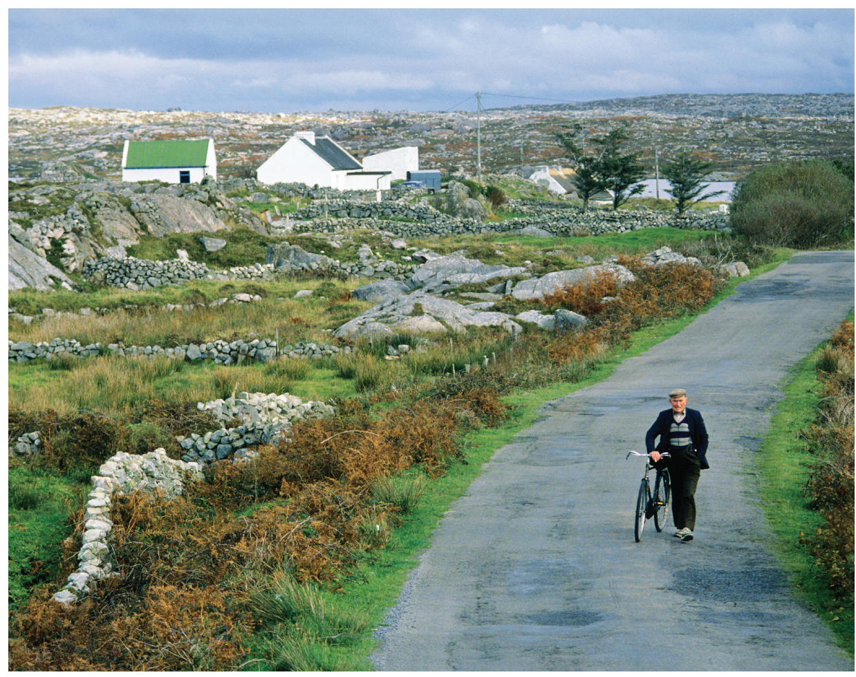
Rural scene in the Connemara, which we explore on Day 5.

Ratings are based on the Hotel & Travel Index, the travel industry standard reference.