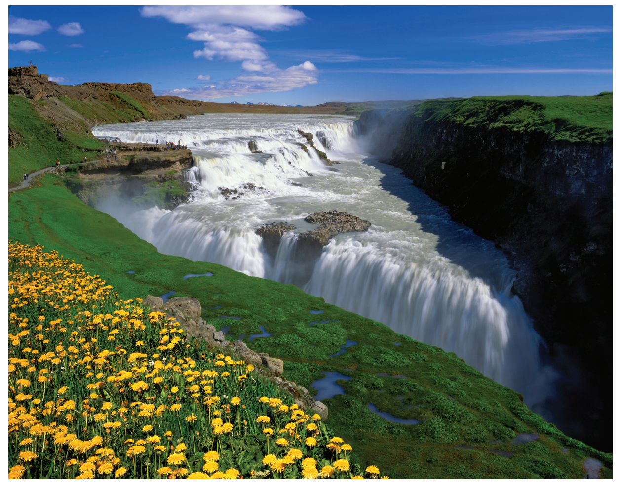
Unique Gullfoss, which we visit on Day 9, ranks as one of Iceland's best loved sights.

Ratings are based on the Hotel & Travel Index, the travel industry standard reference.