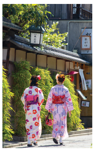
Geishas in traditional dress

is made. Late this afternoon we reach the castle town of Kanazawa, an alluring coastal city that survived the ravages of World War II. B,L