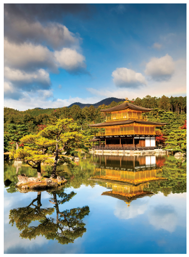
We visit Kyoto's Temple of the Golden Pavilion on Day 10.