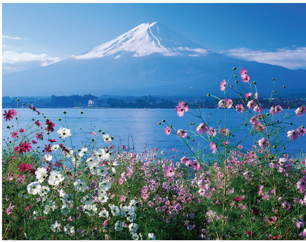
A UNESCO site and "Special Place of Scenic Beauty," beloved Mount Fuji has drawn visitors for centuries.

Ratings are based on the Hotel & Travel Index, the travel industry standard reference. Unrated hotels may be too small, too new, or too remote to be listed.