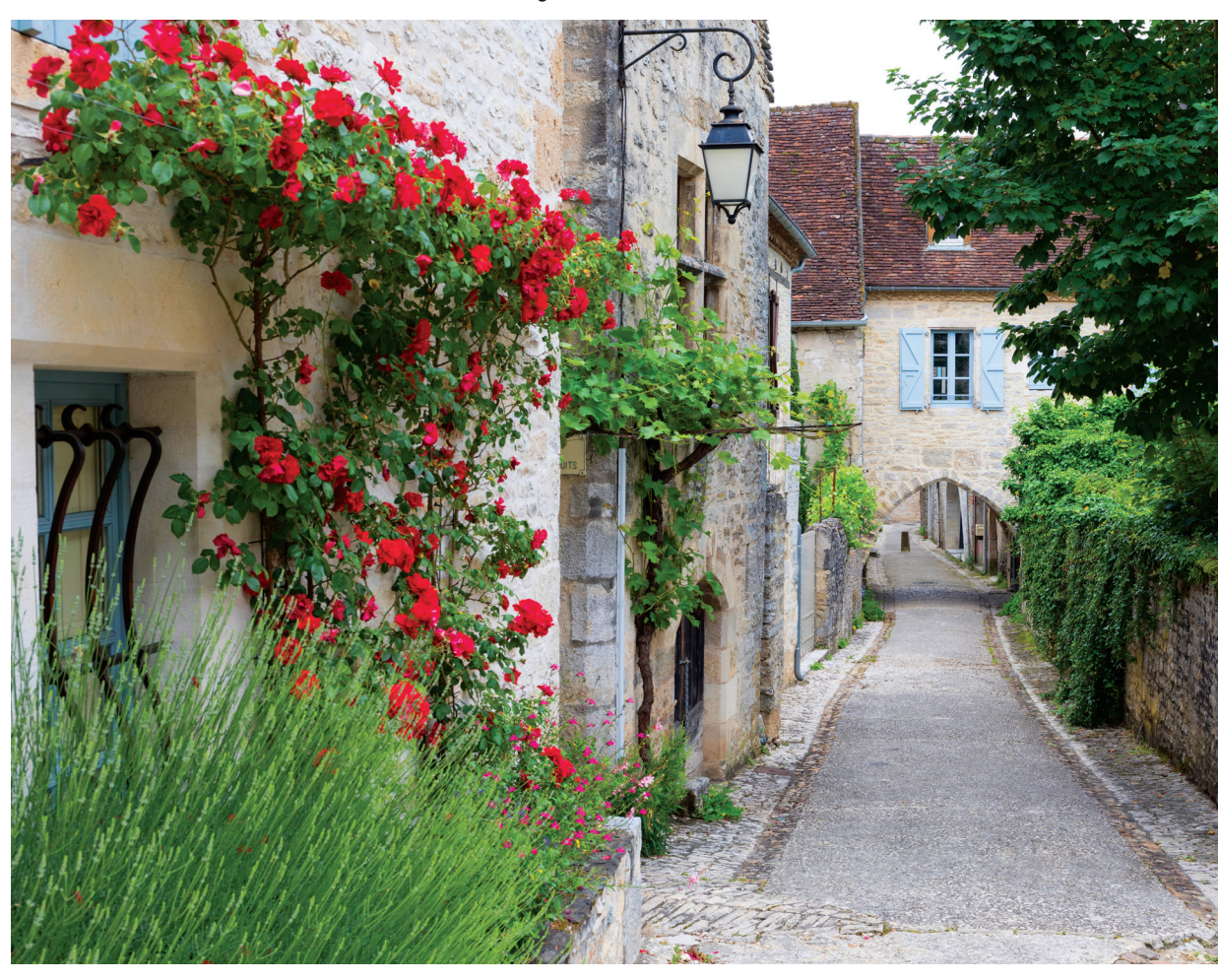
We're sure to see many picturesque sights as we travel through the French countryside.

Ratings are based on the Hotel & Travel Index, the travel industry standard reference. Unrated hotels may be too small, too new, or too remote to be listed.