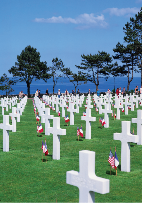
On Day 12, we visit the American Cemetery at Omaha Beach.