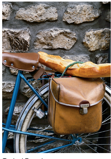
Typical French scene

Day 9: Saumur/Chenonceaux We're in chateaux country, where England battled for control of France; where Joan of Arc triumphed; and where a great opulence reigned during the 16<sup>th</sup> century. Originally built as fortresses to keep intruders out, the Loire Valley's grand chateaux now welcome visitors from around the world. We tour a most impressive one today: Chenonceau, the Renaissance masterpiece considered the most romantic chateau of all. Lunch today is at a local restaurant. B,L