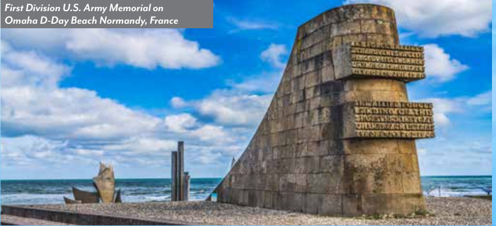
First Division U.S. Army Memorial on Omaha D-Day Beach Normandy, France