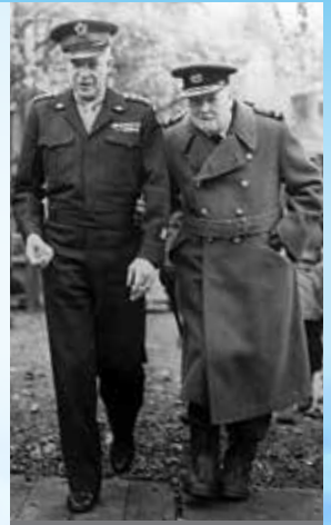
President Dwight D. Eisenhower with Winston Churchill.