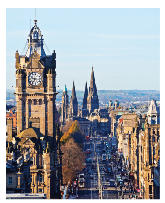
Edinburgh's popular Princes Street