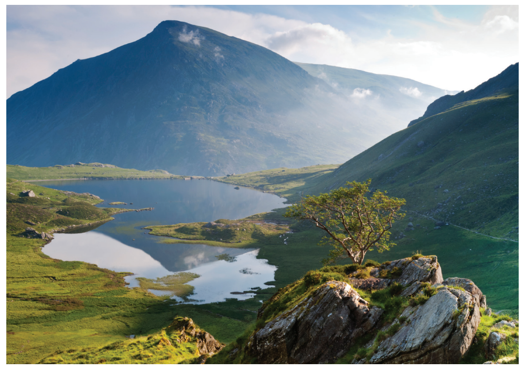
Wales' pristine Snowdonia National Park, which we visit on Day 8

lived nearby in the early 1900s. Late afternoon we return to our hotel and dine there tonight. B , D