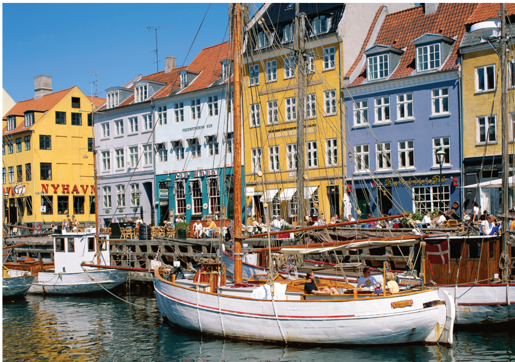
Copenhagen's lively Nyhavn waterfront area

Day 7: Gaala/Geiranger A day of beautiful scenery is in store as we travel from Gaala to Geiranger, en route negotiating hairpin bends to the summit of Mount Dalsnibba (alt. 4,900 feet) for stunning views of Geirangerfjord and the mountains, lakes, and waterfalls beyond. We reach the popular village of Geiranger mid-afternoon and get our first up-close look at Norway's most dramatic fjord. A UNESCO site, it measures 10 miles long and 960 feet deep. B,D