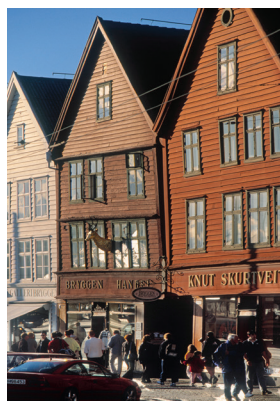
Bergen’s Bryggen district

Day 14: Oslo This morning we visit the Museum of Cultural History, Norway’s largest collection of cultural artifacts, featuring fascinating Viking Age exhibitions, as well as Egyptian mummies and several ethnographic displays.