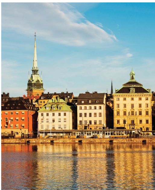
The sun sets over Stockholm, Sweden, as seen on optional extension.