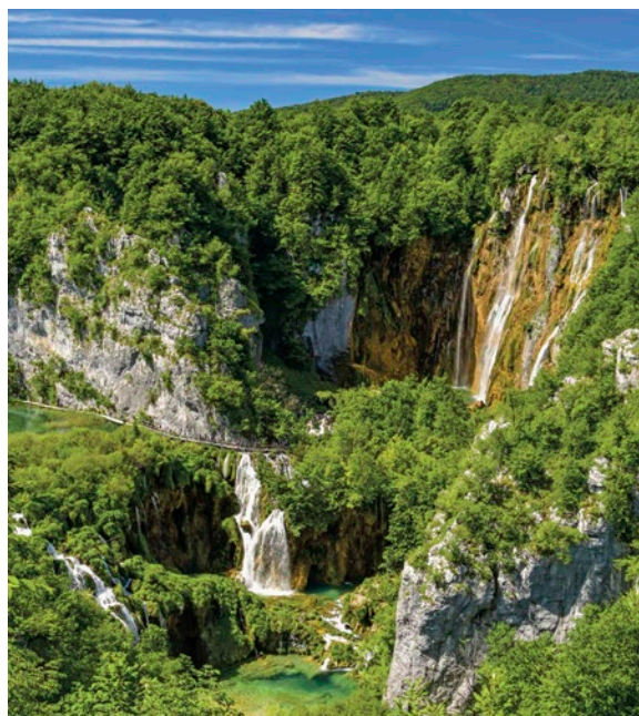
Plitvice National Park

Discover the bounty of Croatia on this incredible 10-night journey, including a seven-night Adriatic cruise! Witness the historic sights and buildings of cosmopolitan Zagreb. Then visit Plitvice National Park, an astonishing marvel of nature. Board your first-class ship and sail the Dalmatian coast to enchanting islands and timeless ports of call. Walk along cobblestones brimming with maritime legends and see landscapes that stir your soul. Plus, choose between touring the Cathedral of St. James or Krka National Park in Šibenik. Your adventure concludes in one of the world's best-preserved medieval towns in legendary Dubrovnik!