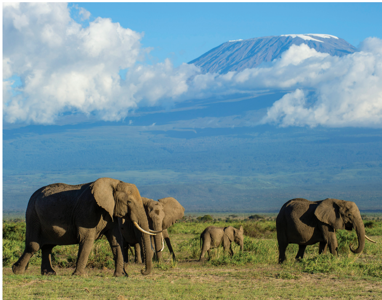
We go on safari in Kenya's Amboseli National Park, in the shadow of Mt. Kilimanjaro.