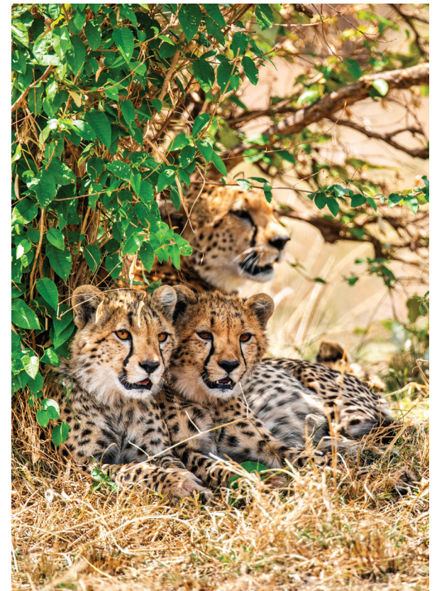
Cheetahs in Masai Mara