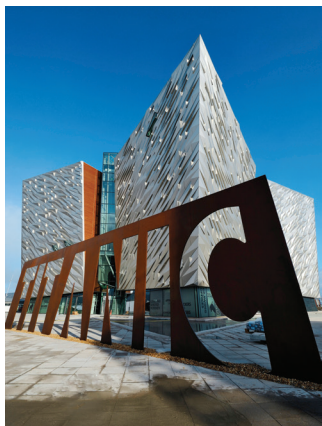
Titanic Museum, optional extension

Day 8: Killarney Our exploration of this attractive town, founded as a resort in the 18 th century, begins with a jaunting cart ride from the center of town to 15 th -century Ross Castle, the last stronghold to fall to Oliver Cromwell’s forces in 1652. Then we travel by boat to Muckcross House, a 19 th -century Elizabethan-style manor which showcases the art and craft of bookbinding, pottery, and weaving. We tour the elegantly furnished rooms, as well as the informal garden. Lunch is on our own here before