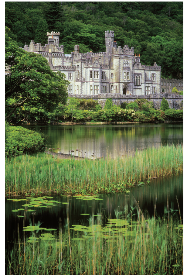
We tour Kylemore Abbey, home to Benedictine nuns.

Day 13: Depart for U.S. We leave this morning for the Dublin airport and our return flights to the United States. B