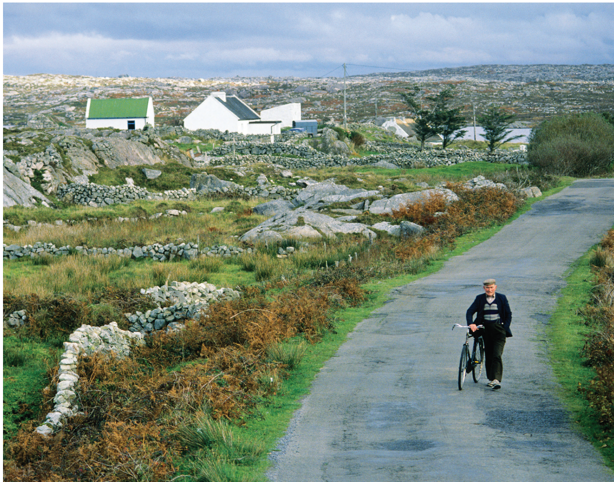
Rural scene in the Connemara, which we explore on Day 5.

It's a beautiful, magical land, where the gentle green landscape dazzles and the people delight; where warmth and hospitality are national traits and poets are national heroes. From Dublin to Galway, Killarney to Kilkenny, this full yet well-paced tour showcases Ireland's many charms – both old and new – to our small band of travelers.