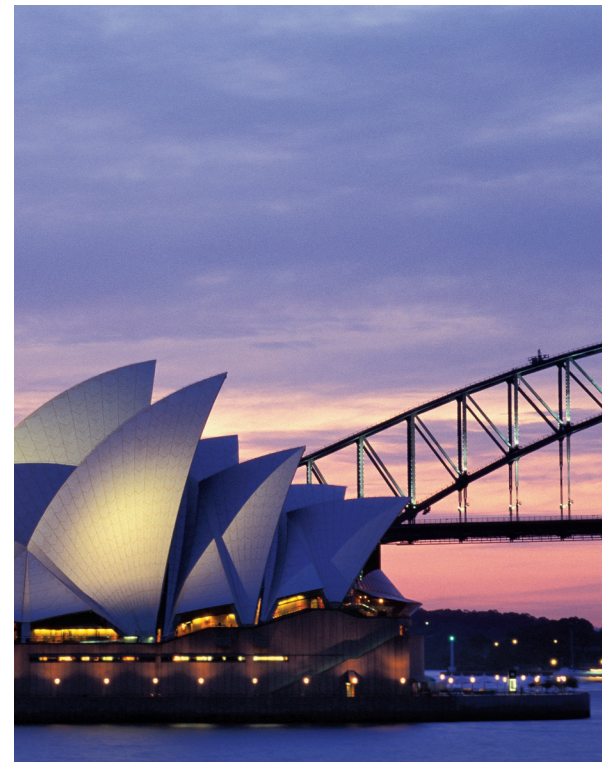
The Sydney Opera House and Harbour Bridge at dusk

Day 22: Depart for U.S. This afternoon we depart for the airport for the flight to Los Angeles (via Sydney) and our return flights home. B