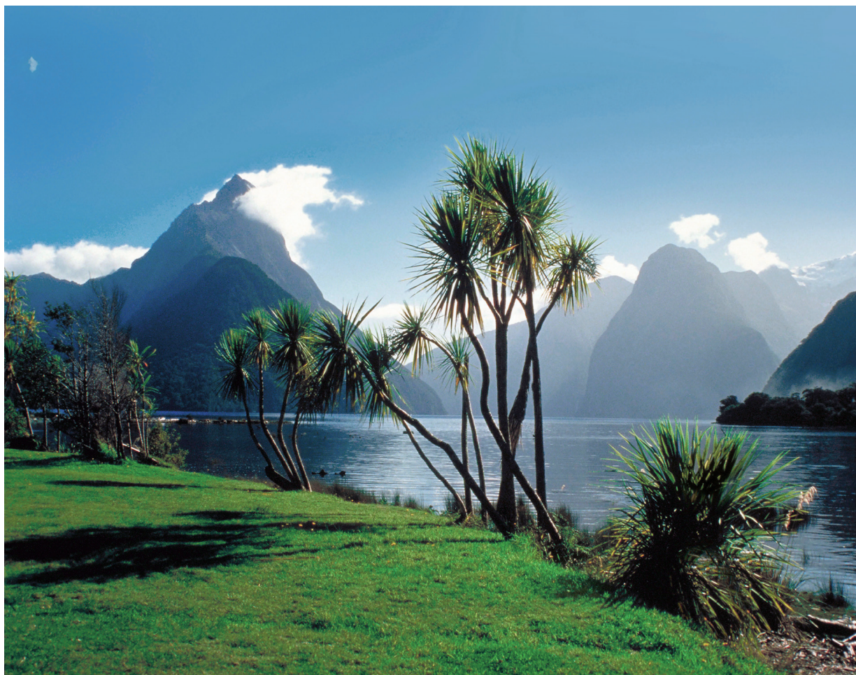
On Day 16, we see for ourselves why serene Milford Sound ranks as New Zealand’s most popular destination.