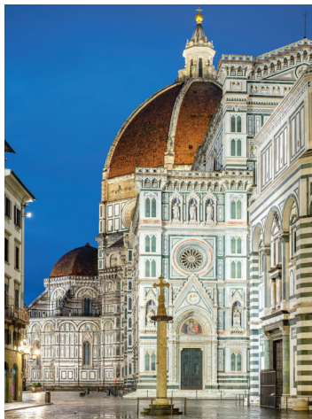
Florence's Duomo and Baptistery

We spend today touring and exploring wondrous Florence, a living monument to the Renaissance and crown jewel of Tuscany. Our day includes a guided morning walking tour followed by free time. Together we visit the Galleria dell'Accademia to view Michelangelo's sublime David and his pieces for the papal tombs; and the Duomo , with its stupendous dome by Brunelleschi. Then we're free to stroll the 14 th -century Ponte Vecchio, with its many jewelry shops; visit renowned museums and churches; shop for leather goods and artful Florentine paper; and to enjoy lunch on our own. We return to our hotel in the mid-afternoon. B