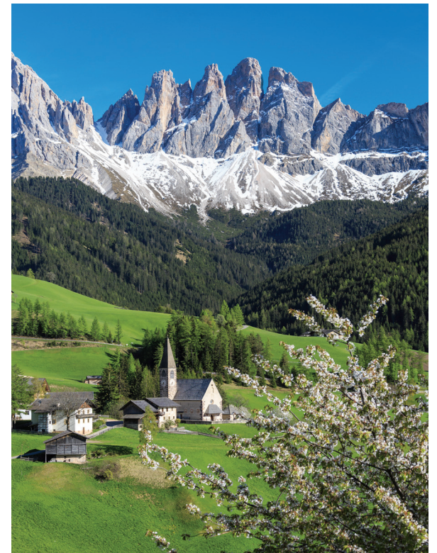
We enjoy stunning Dolomites scenery in the South Tyrol.

Day 14: Venice This morning we take a guided walk through vast St. Mark's Square. The afternoon is free for independent exploration; tonight we bid “ arrivederci ” to Italy and to our fellow travelers at a farewell dinner. B,D