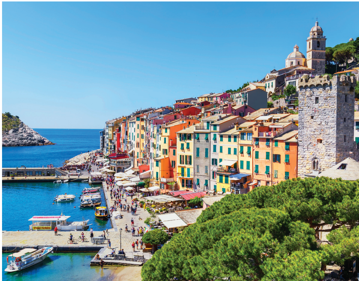
We explore the Cinque Terre by land and sea on Day 7.