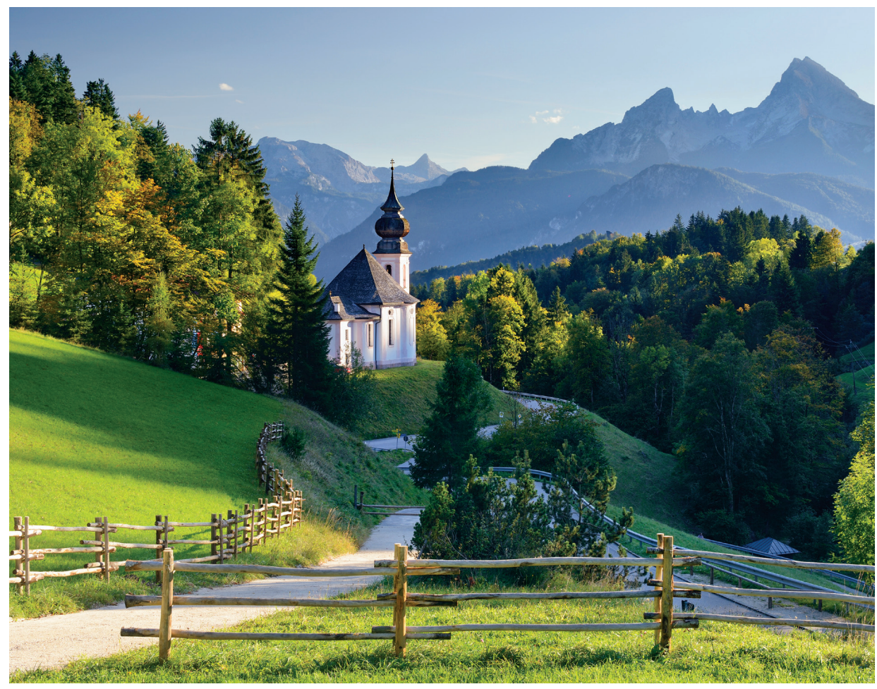
Majestic Alpine scenery surrounds us throughout our tour.