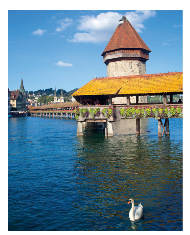
Lucerne's beloved Kapellbrücke (Chapel Bridge)