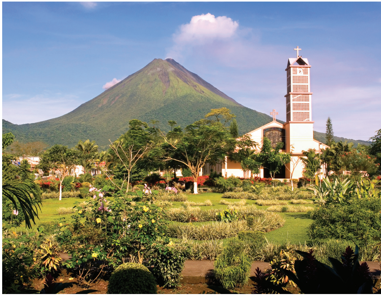
We see Arenal, one of the world's most active volcanoes, from a safe distance.

Ratings are based on the Hotel & Travel Index, the travel industry standard reference.