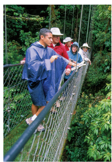
Arenal's hanging bridges

Day 8: Monteverde/Guanacaste We depart by coach this morning for Guanacaste, Costa Rica's