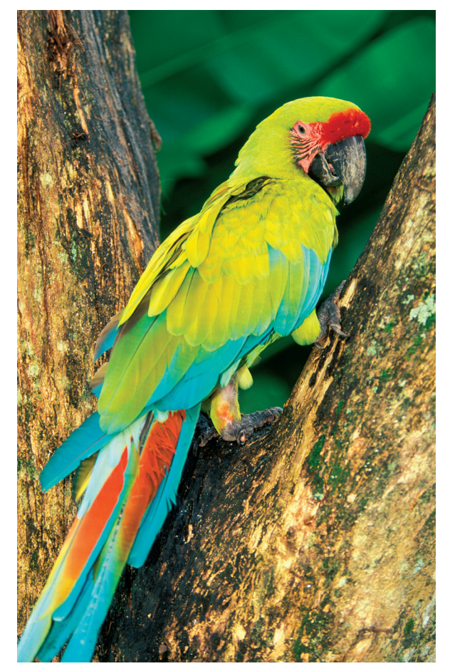
Local birdlife includes the Great Green Macaw.