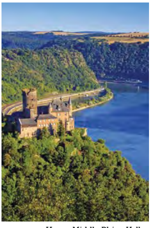
Upper Middle Rhine Valley