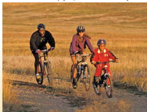
Above: Speyer | Below: Waterland bicycle ride