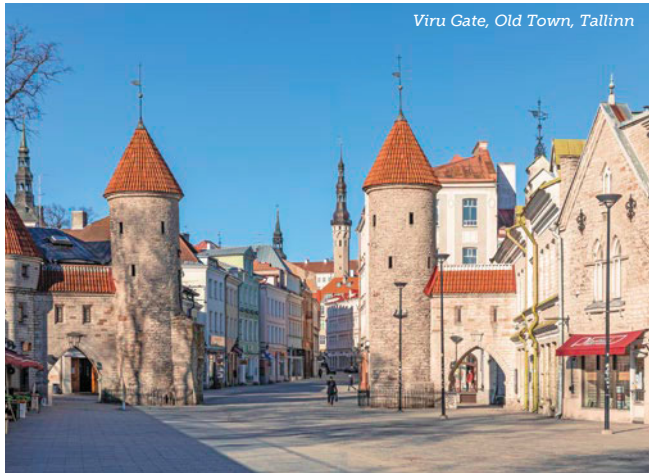
Viru Gate, Old Town, Tallinn