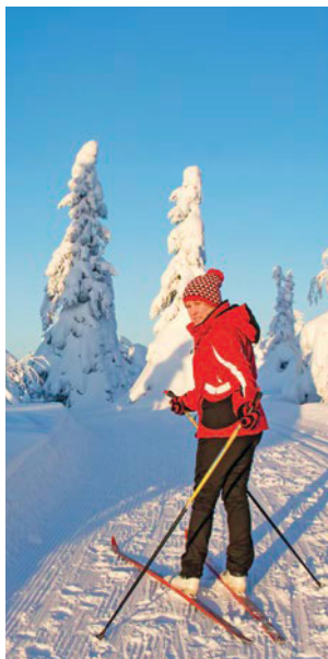
Exploring at Northern Lights Village