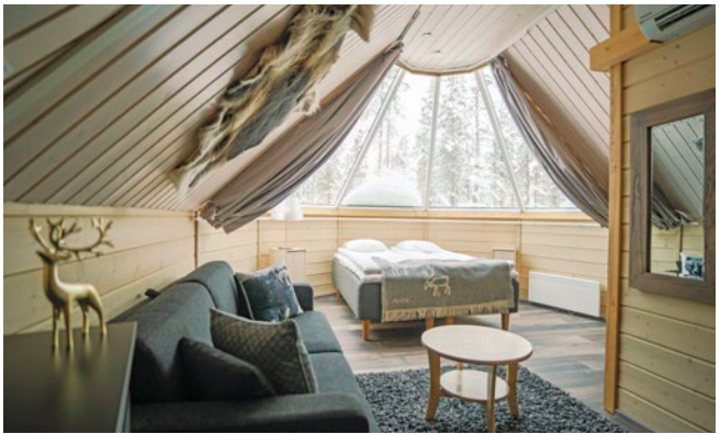
Northern Lights Village | Saariselkä