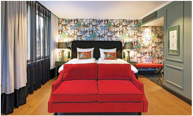
Hotel U14 | Helsinki