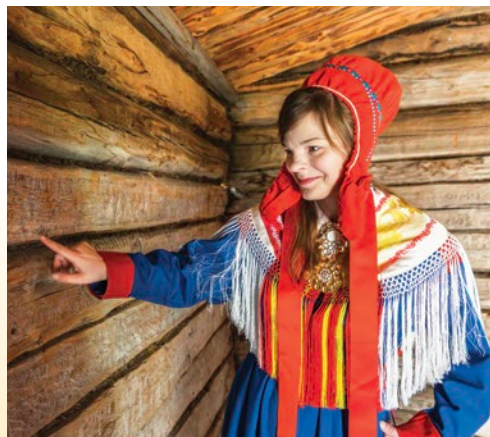
Sámi woman, Sámi Museum Siida

Sámi Museum Siida. View exhibits about the traditional livelihoods, customs and handicrafts of Finland's Sámi cultures at this fascinating museum in Inari. Explore an outdoor area with dwellings, dugouts, turf buildings and traps. Relish a delicious, authentic Finnish lunch.