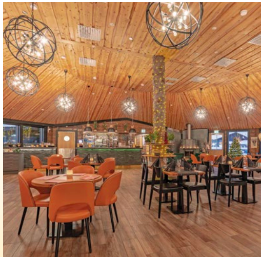
Restaurant, Northern Lights Village