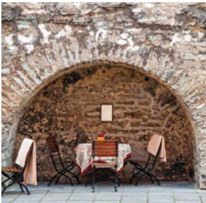
Old Town, Tallinn

Historic Center (Old Town) of Tallinn, Estonia