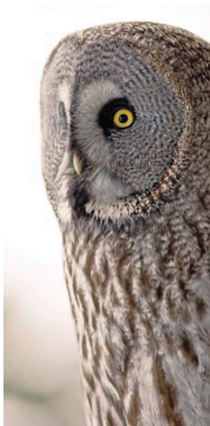
Great Grey Owl, Lapland