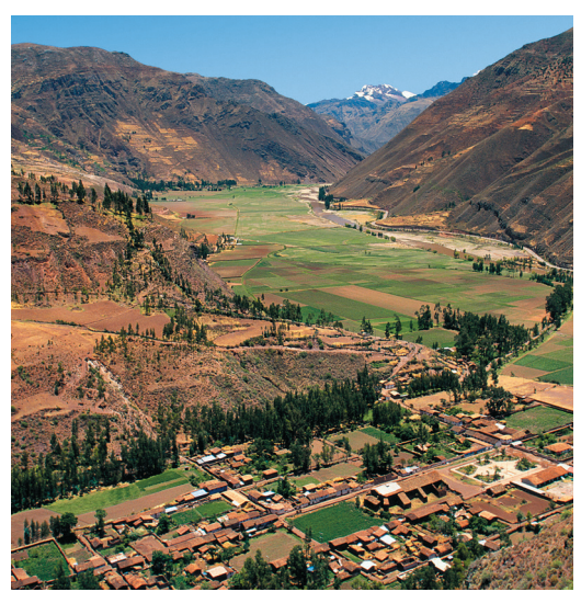
The beautiful and historic Sacred Valley

check into our day rooms at an airport hotel. Late this evening we depart on our flight to the U.S. B,L