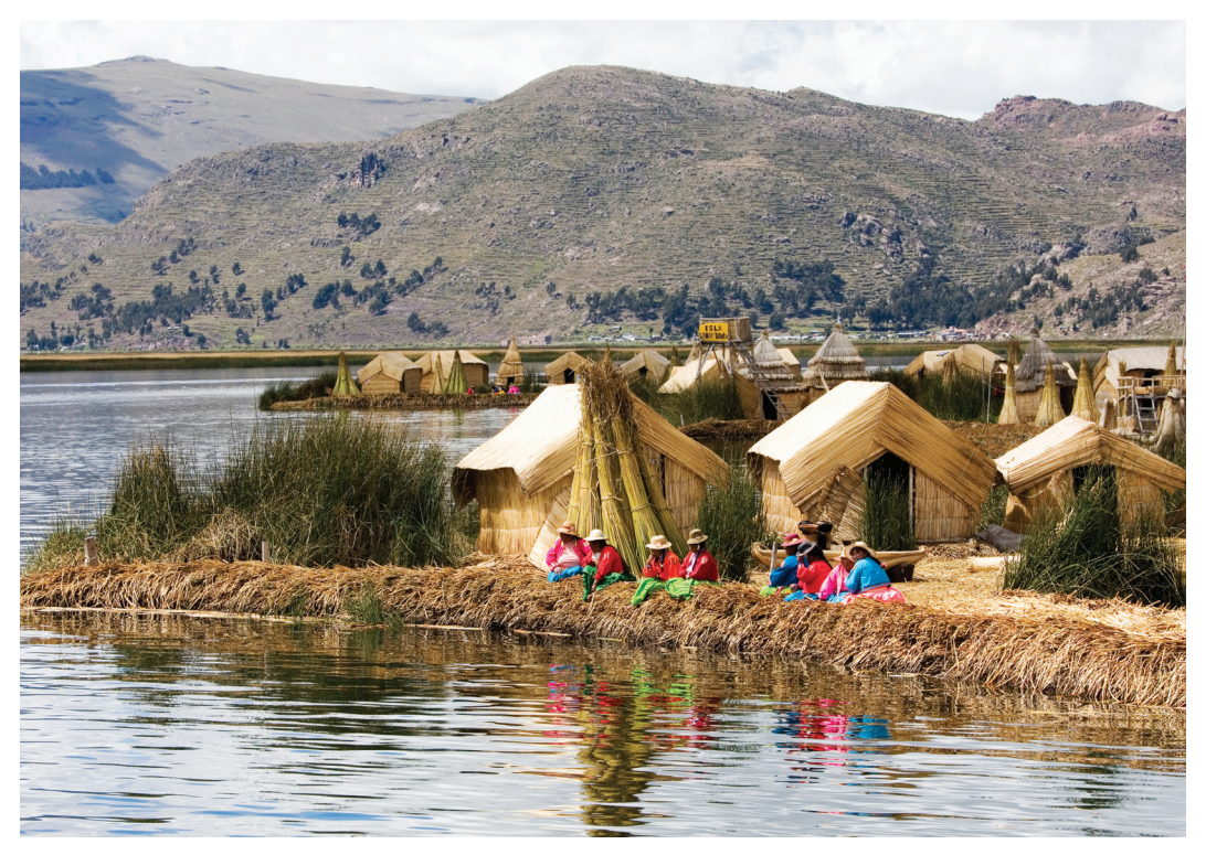
Local women gather on Uros Island

Aguas Calientes and our hotel, with time at leisure before dinner together tonight. B , L , D