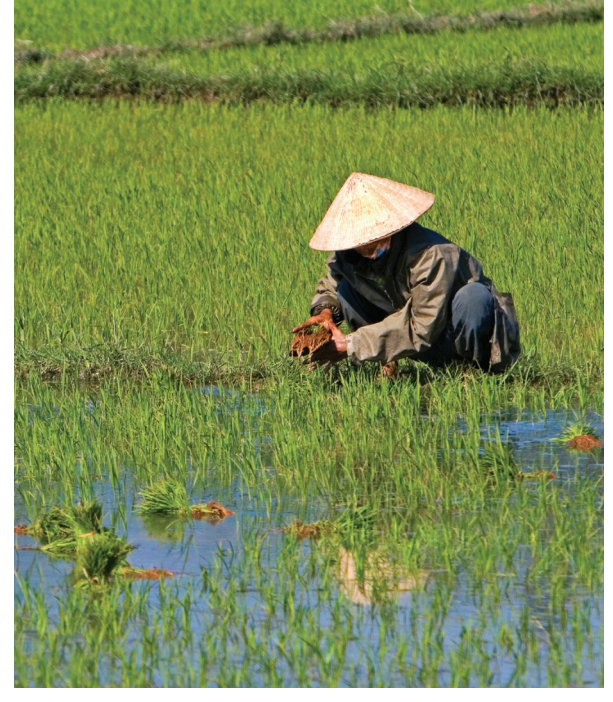
A local farmer tends a rice paddy.