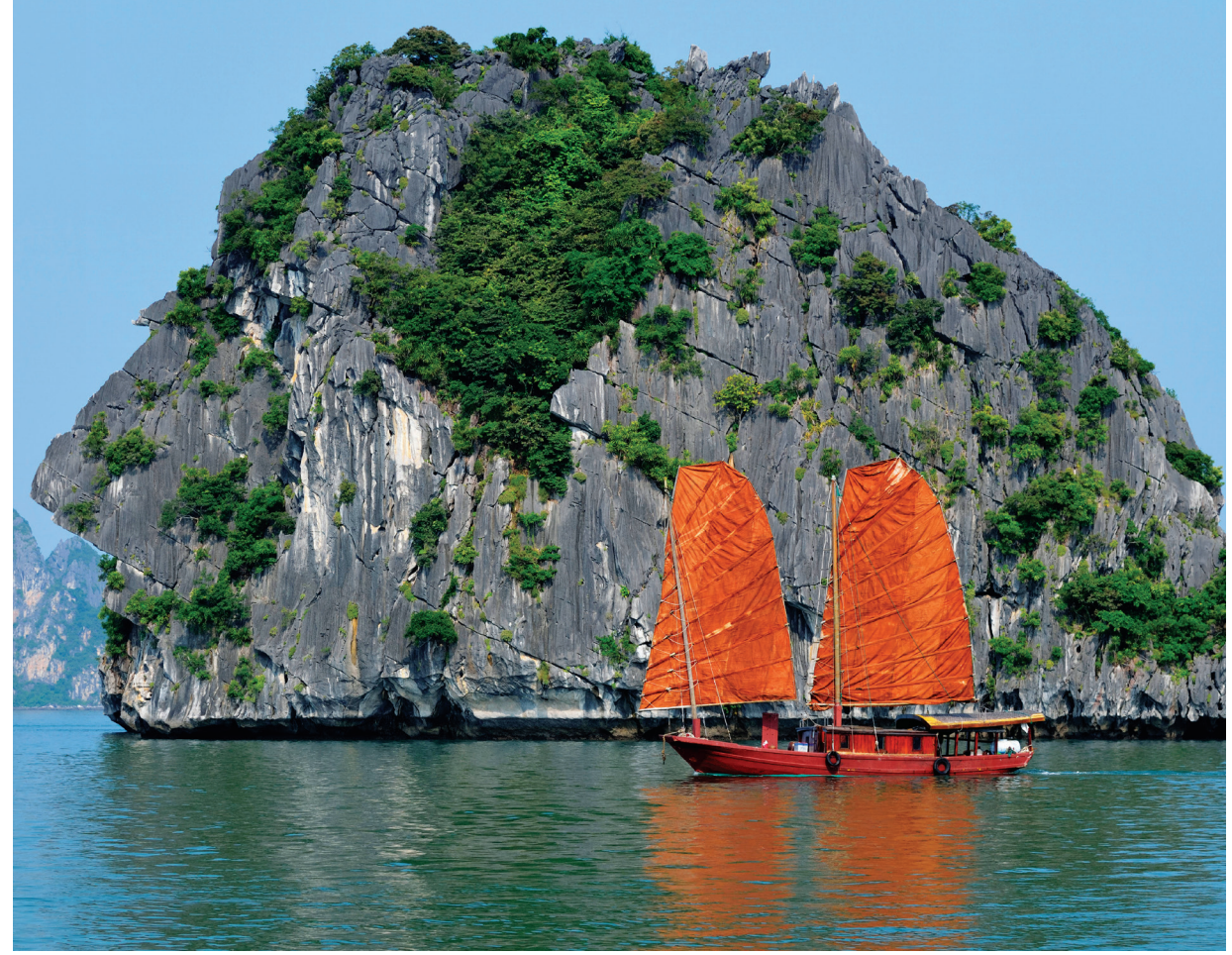
We visit the World Heritage site of Ha Long Bay on Day 4.

Ratings are based on the Hotel & Travel Index, the travel industry standard reference.