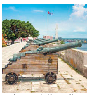
Cannons at fortification, Havana