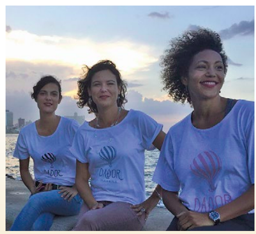
Founders and owners of Dador

Later today, visit the Ludwig Foundation, a nonprofit cultural institution that is dedicated to protecting and promoting Cuban artists.