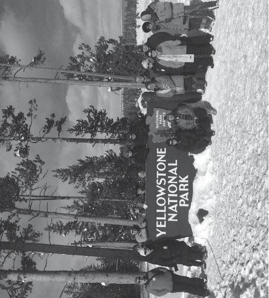
UNC alumni on Orbridge's The Wolves and Wildlife of Yellowstone 2019 travel program.