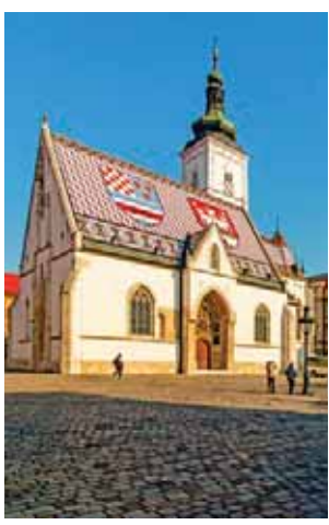
St. Mark's Church, Zagreb