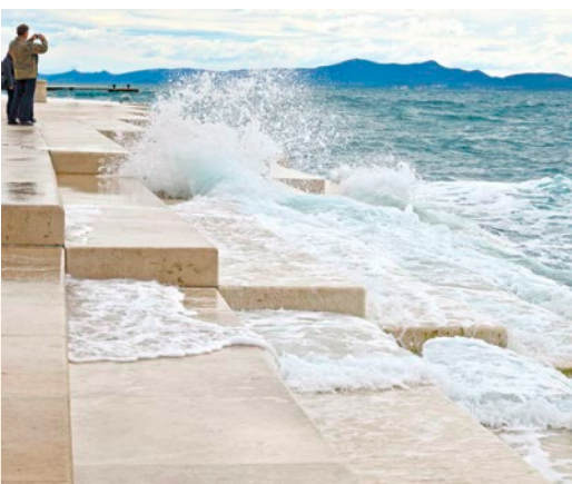
Sea organ, Zadar

Hvar Island. Uncover the sights of sunny Hvar, including its Renaissance cathedral, a community theater and a convent dedicated to