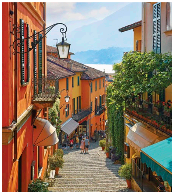
Bellagio, Lake Como