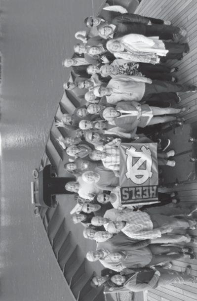
Tar Heels on Obridge's Discover Southeast Alaska by Small Ship 2021 travel program.

Special Alumni Rate: Save more than $1,000 per couple