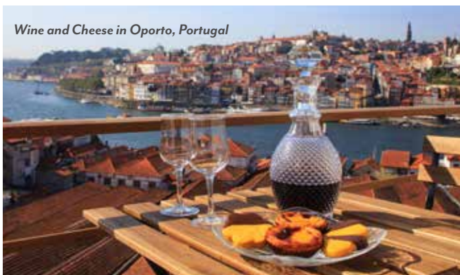
Wine and Cheese in Oporto, Portugal

Visit the UNESCO World Heritage Site of Santiago de Compostela, and stroll along medieval stone streets