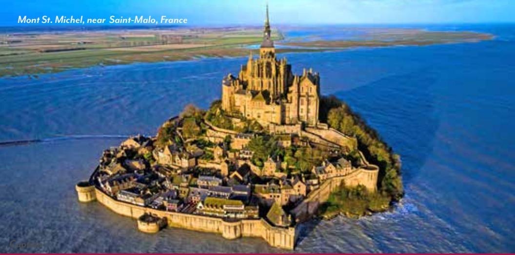
Mont St. Michel, near Saint-Malo, France

above the sea, the UNESCO World Heritage-designated Mont-Saint-Michel is a sight of soaring spires isolated beyond a stretch of saltwater marsh. This fortified village began as a humble oratory and became a renowned medieval center of learning. Cobblestone streets weave through the village, culminating in the Abbaye du Mont-Saint-Michel, a three-story Gothic masterpiece. Admire the serene cloisters, barrel-roofed réfectoire, and Salle des Hôtes of the 13 th -century La Merveille and the magnificent Église Abbatiale. (B,L,D)