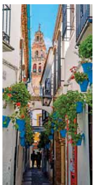
Jewish Quarter, Córdoba