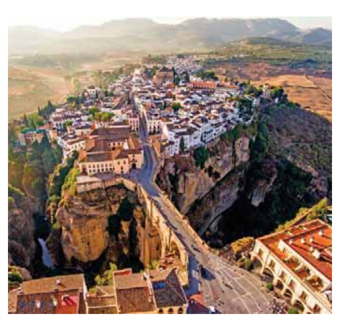
El Tajo Gorge, Ronda