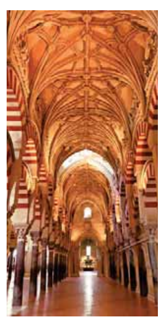
La Mezquita, Córdoba

Knowledgeable Lecturers deepen your appreciation for the region and its history, culture and current events.