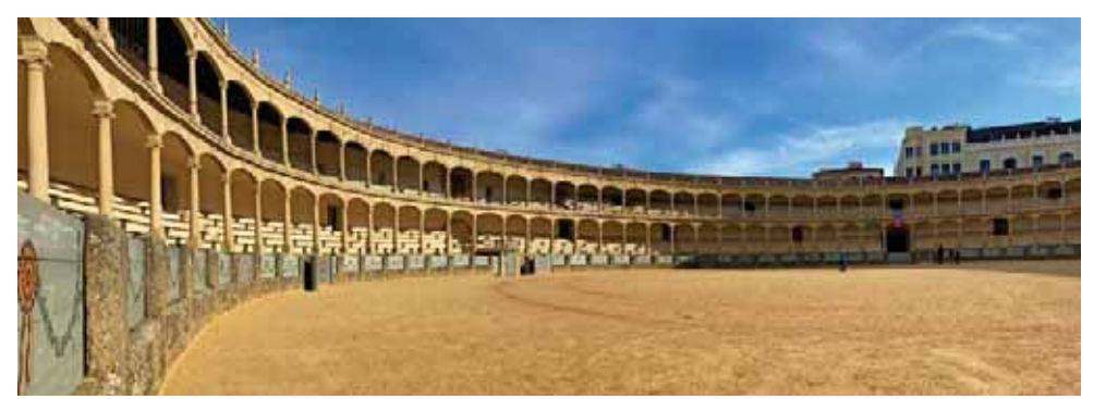
Plaza de Toros, Ronda